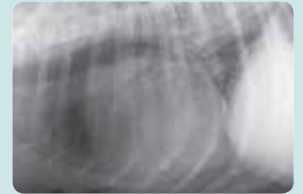
Chest x-ray of a dog with an enlarged heart and heart failure. Specifically formulated cardiac diets are a key part of treatment.